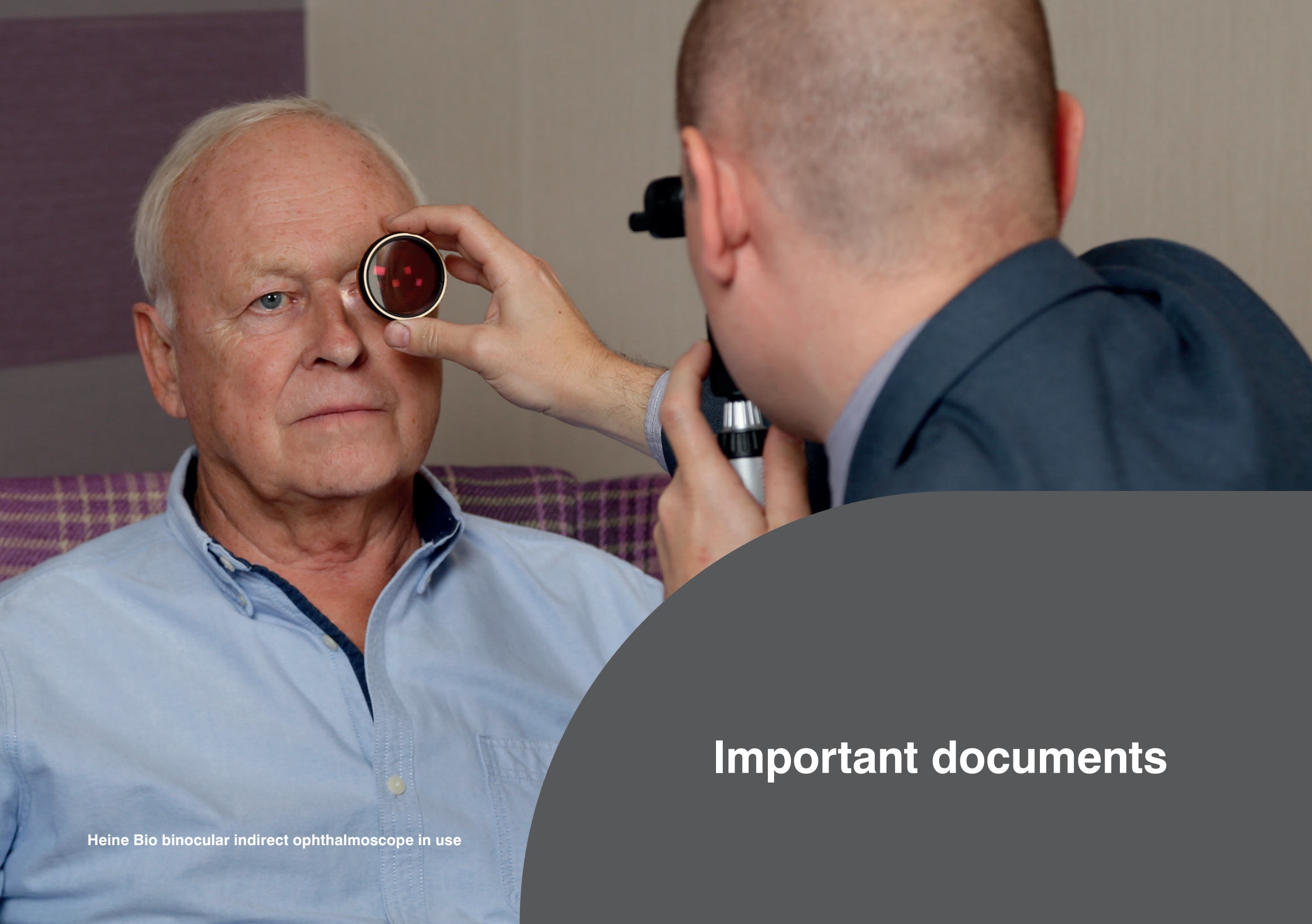
Heine Bio binocular indirect ophthalmoscope in use